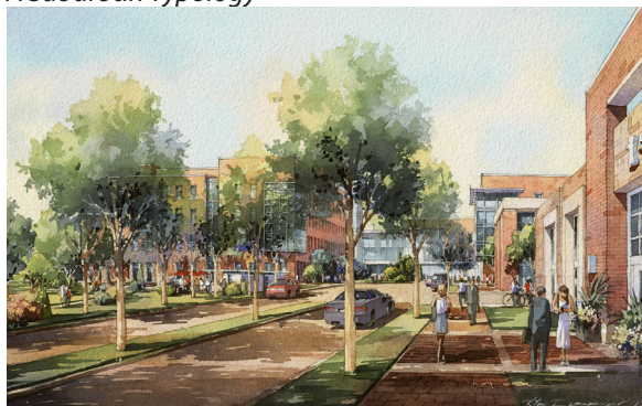
A Suburban Typology

Early in the planning phase campus design principles were established to guide development of the hospital and future phases of the mixed use components. The design principles focus on creating a vibrant public realm through connectivity, a mix of uses, walkable streets and neighborhoods, a campus-like feel and stylistic building diversity.